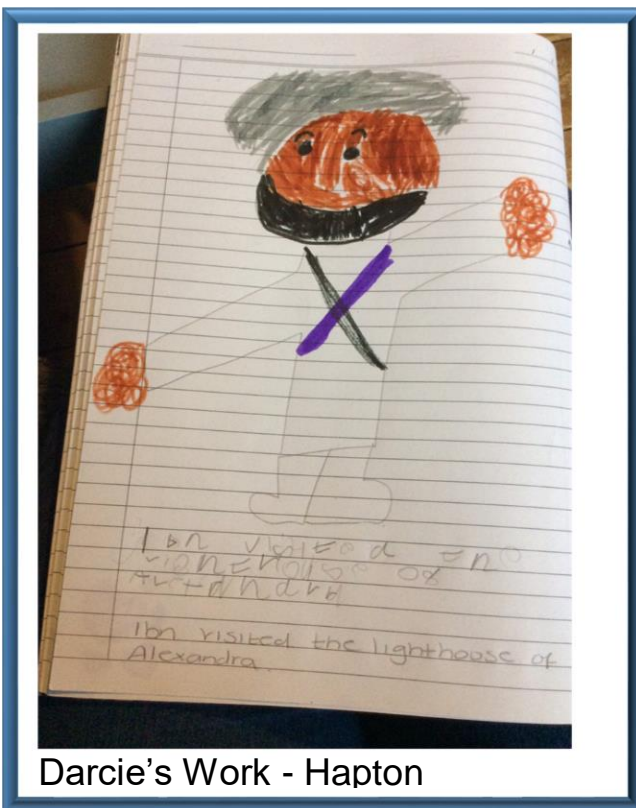
Darcie's Work - Hapton