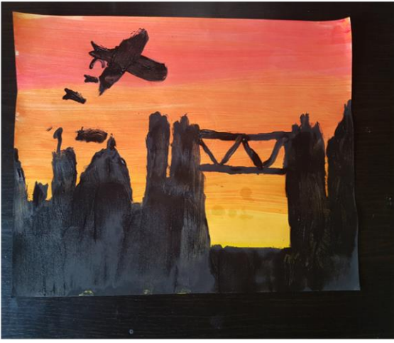
Summer – All Saints